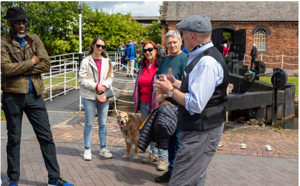
'Canal Town' costumed tour guides