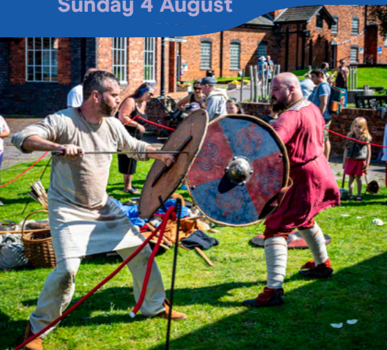
The Unknown Vikings

Come and see how your ancestors lived and immerse yourself in the Viking Age! Take part in interactive activities throughout the day as costumed performers entertain visitors with Viking battles and displays.